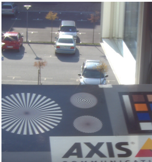
Old technology (cropped view)