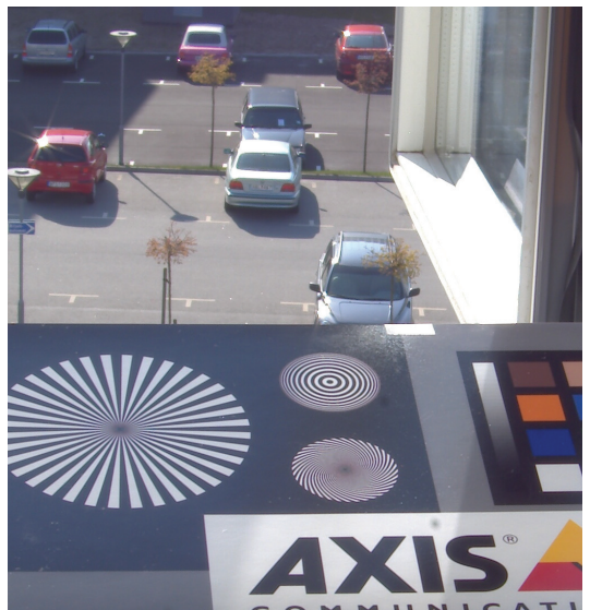
P-Iris (cropped view)